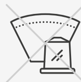
Coffee filters & pods